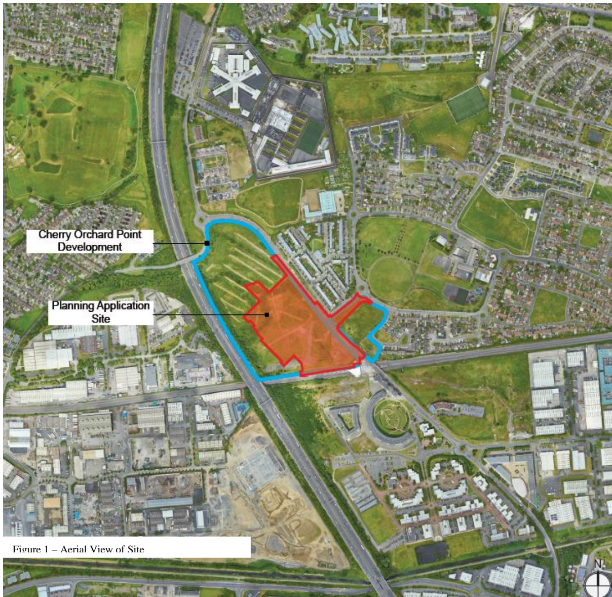
Figure 1 – Aerial View of Site

as Natura 2000 sites, and in Ireland they include Special Areas of Conservation (SAC's) and Special Protection Areas (SPA's). Article 6(3) and (4) require that an Appropriate Assessment be carried out for these sites where projects, plans or proposals are likely to have an effect on the protected site.